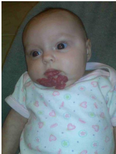
2 weeks later after first laser treatment