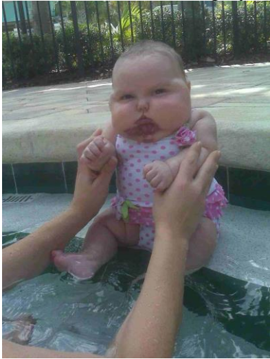
After her 3 rd laser surgery