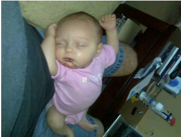
1 ½ months old