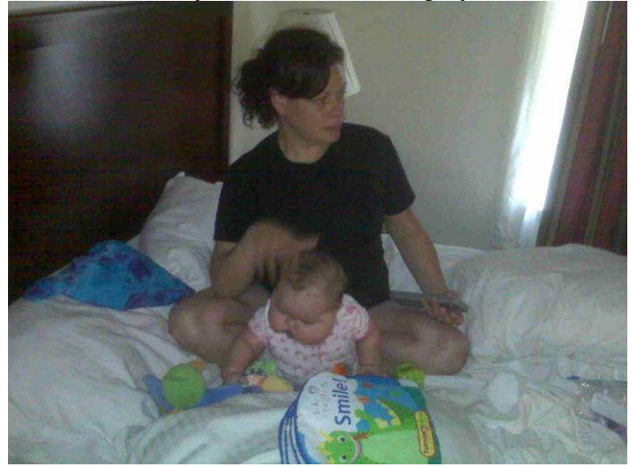
Day of her 4 th laser surgery