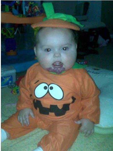
1 ½ months later off of steroids